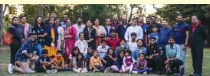
but can co-exist.

Our Holy week services were held at St Joseph's Catholic Church Elsternwick.